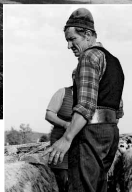
Romanian semi-subsistence agriculture – would it pass the EU's viability test (see page 10)?