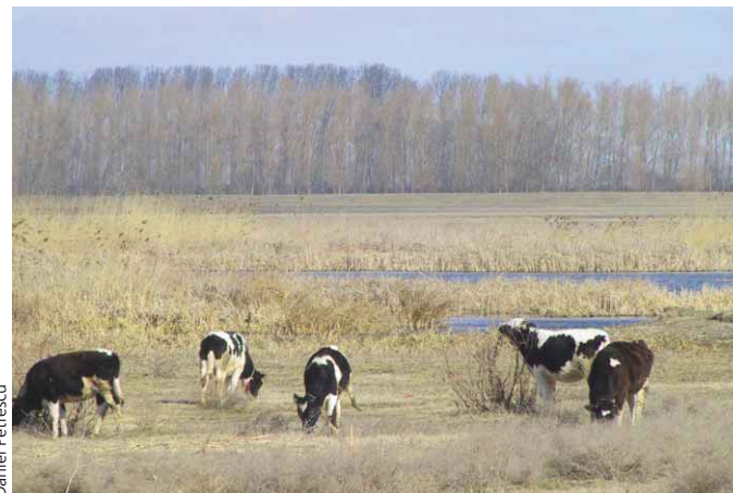
The local grey steppe cattle have been replaced by free-ranging Holstein cross-breeds, here feeding next to reedbeds in the Danube Delta.

Some of these farming systems involve not only the use of enclosed fields, but areas of open semi-natural pastures, particularly in the Carpathian mountains, which form the spine of the country. For example,