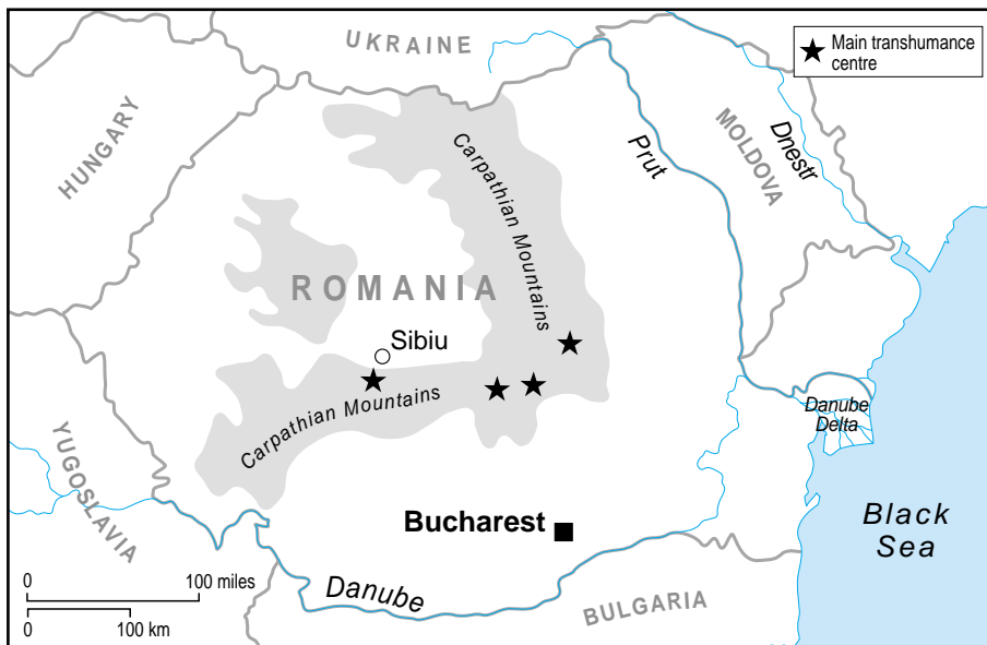
Map of Romania, showing transhumance centres in relation to the Carpathian mountains.

region the main sheep breeds used to be called Vlach/Wallachian (a general nickname for Romanians and the linguistically-related Aromanians throughout the Byzantine empire).